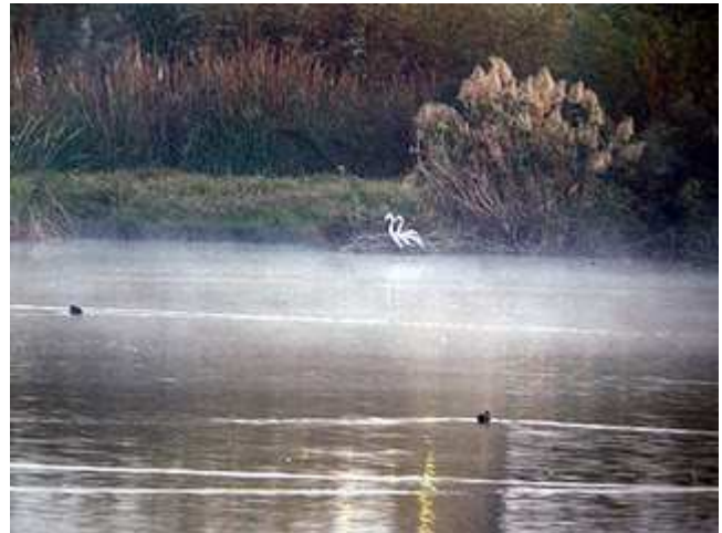
Flamingos in the mist.

At the Marismas de O'diel we first stopped at the laguna Calatillo where the Coot had bred for the last few years, again we dipped but there many birds wading or floating in the water. Waders included our first Turnstone, but also Black-tailed Godwit, Common Sandpiper, Common Snipe, Ringed Plover, Dunlin, Sanderling and a single Curlew Sandpiper. The other species included Greater Flamingo, Pintail, Shovler, Teal, Gadwall, Common Pochard and Mallard.