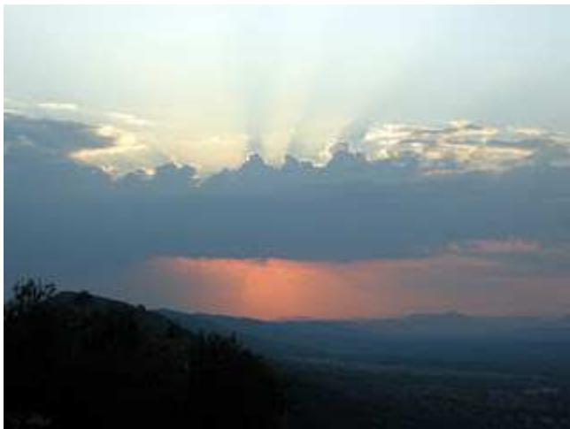
SUN RISE WITH UNCERTAINTY?

We spent the whole day in and around the park at Monfrague and had a great time. We set off at 7:45am, in the car park we saw an Owl fly from a post, in the dark we thought it was a Little Owl, we drove the 60 kilometers to Monfrague without further sightings. It was overcast, a bit chilly and still quite dark when we arrived at the base of the Castillo de Monfrague.