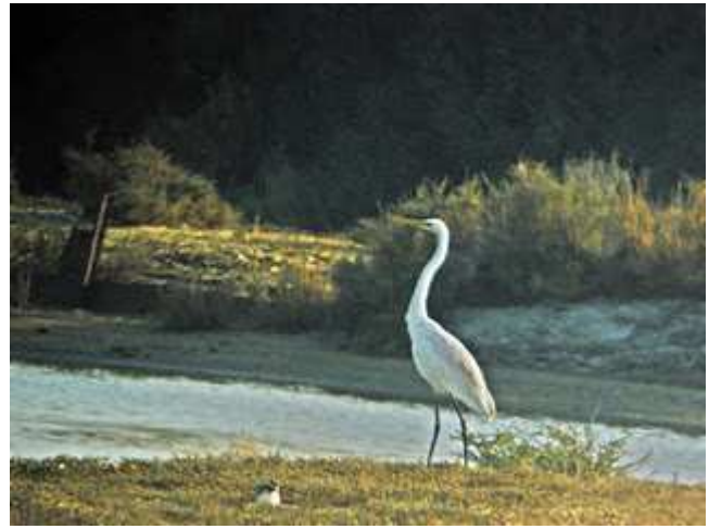
GREAT WHITE EGRET

We then spent the next couple of hours driving down towards the lighthouse on this superb salt marsh, we passed ancient salt pans, open dry scrub, stone pine woodlands and a large expanse of marshes with open brackish water. Species present we in their thousands, we found White Stork, Great White Egret (2), Little Egret, Cattle Egret, Eurasian Spoonbill (50+), Oystercatcher, Avocet, Black-winged Stilt, Stone Curlew (32), Knot, Redshank, Greenshank, Spotted Redshank, Grey Plover, Little Stint and many of the other waders already listed. A few Common & Sandwich Terns sat amongst the Audouin's, Lesser Black-backed and Yellow-legged Gulls.