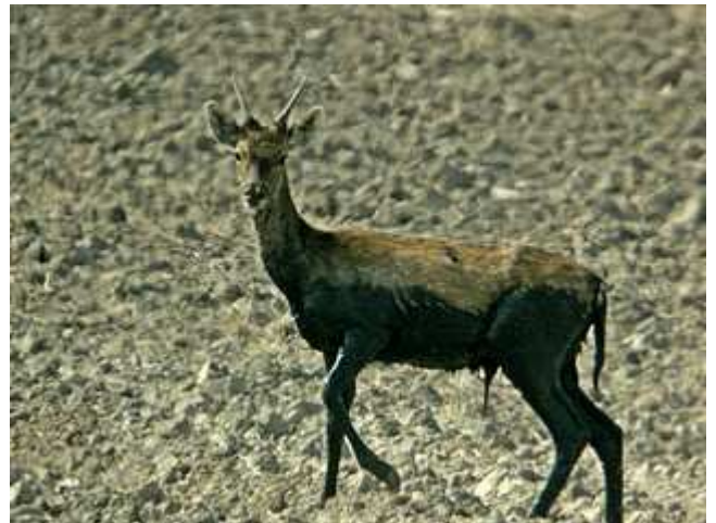
FALLOW DEER - JUST OUT OF THE MIRE!

After a coffee stop we headed back along a different route hoping to find an Eagle or two, instead we found a lot more Lesser Kestrels, a herd of Fallow Deer and more distant Flamingos. We arrived back at the hotel at 5:30pm, a long day but a very enjoyable last day in the area.