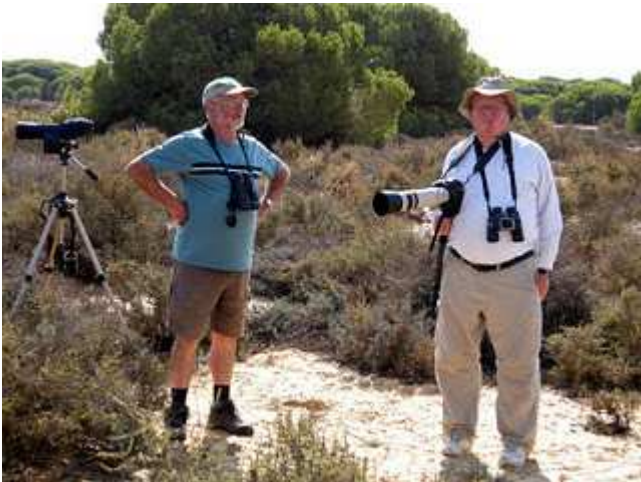
Now where is that Bluethroat? El Rompido

BRIGHT sunshine throughout with nice temperatures with a nice cooling breeze. We set off in the dark towards Huelva and stopped at the lagunas del Palos just before the city. With a backdrop of a large oil refinery this superb nature reserve looks so out of place, however over the years I have recoded many species there, including Re-knobbed Coot. We couldn't find the Coot but we watched many other wildfowl, we added Wigeon, and Pintail to our list.