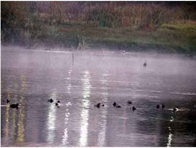
DUCKS AT FIRST LIGHT